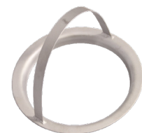
Stainless Steel hold-down device