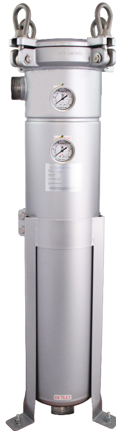
Size 2 bag housing with optional pressure gauges