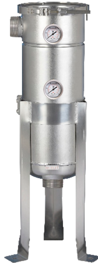
Size 3 bag housing with optional pressure gauges